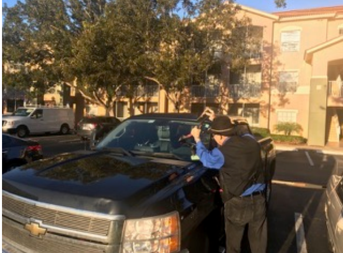
Kept coming, couldn't stop it!!!